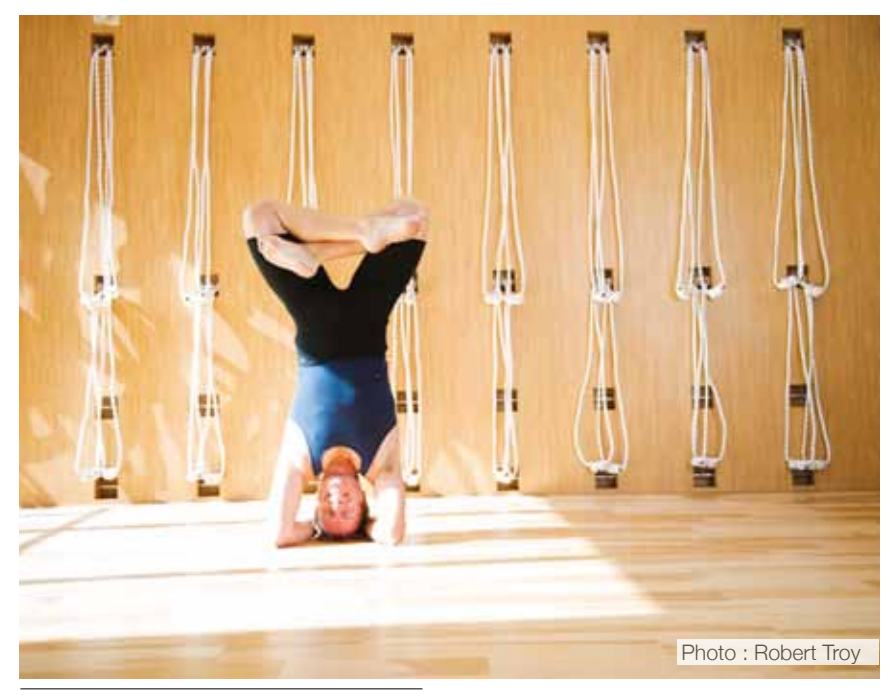
Photo taken at Namastday Yoga (http://namastday.com) in Beverly Hills.

GM: Fear is a big motivating factor for many people. It certainly was for me. Being a young guy, I wasn't ready to just roll over and take the drugs. I'm not saying to anyone to not take the drugs. But I wanted to see if I could maintain my mobility